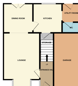
GROUND FLOOR 484 sq.ft. (45.0 sq.m.) approx.