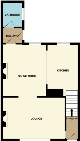
GROUND FLOOR 1ST FLOOR

Whilst every care has been taken in the preparation of this leaflet, if there are any points upon which you are relying, please confirm them with the vendor before viewing or especially before making an offer. We cannot guarantee that the information is correct and if any items are important to you, you must ask us to produce the evidence you require before viewing or making an offer, and especially ask your solicitor to make these checks before exchanging contracts. Please also remember that measurements may have been taken using an electronic tape measure. They, like any distances mentioned are for guidance only and should under no circumstances be relied upon. Please note that none of the services or appliances connected to or fitted within this property have been tested, and purchasers are advised to make their own checks where necessary. No guarantee can be given that they are in working order. We have not check rights of way, footpaths, covenants, easements, wayleaves, nor existing or proposed planning permissions or building regulations concerning this property or the surrounding area. Internal photographs are reproduced for general information and it must not be inferred that any item shown is included in the sale.